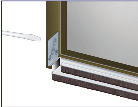
Adjust Bottom Brush at hinge stile