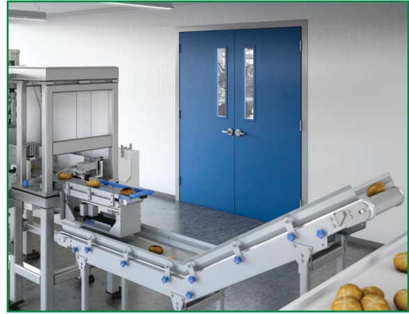
All Fiberglass Composite Doors are FDA/USDA compliant

SL-301 Adjustable Bottom Brush not compatible.