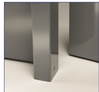
Fixed or Removable Mullion