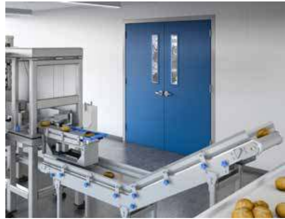
All Fiberglass Composite Doors are FDA/USDA compliant

SL-301 Adjustable Bottom Brush not compatible.