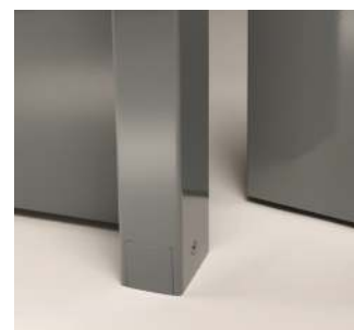
Fixed or Removable Mullion