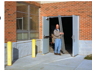
Removable Center Post