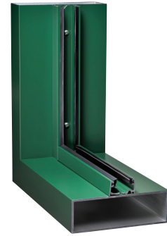
Tube Frame with Applied Stop