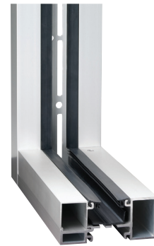
Flush Glazed Framing