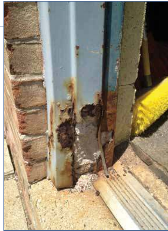
Example of hollow metal frame rusted and corroded from the elements