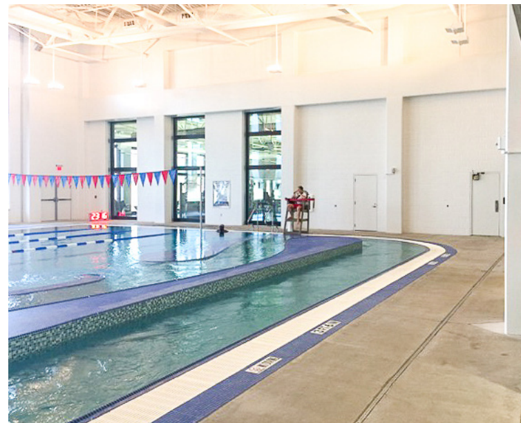
Corrosion-resistant poolside Pultruded Fiberglass Doors (AF-100).