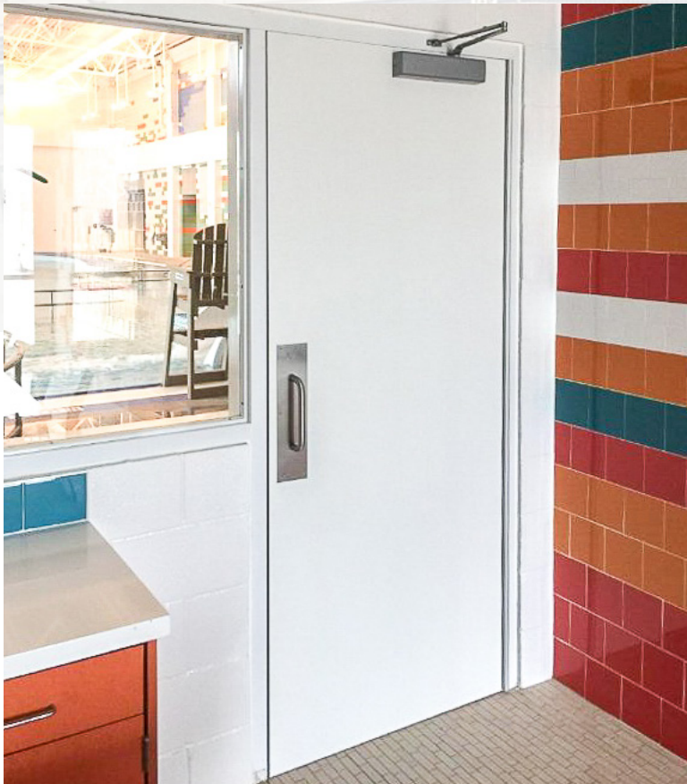
Pultruded Fiberglass Doors and Frames (AF-100) remain corrosion-free for life, unlike hollow metal doors.