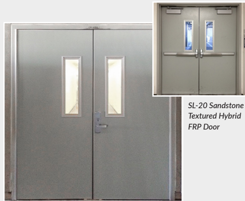
SL-20 Sandstone Textured Hybrid FRP Door