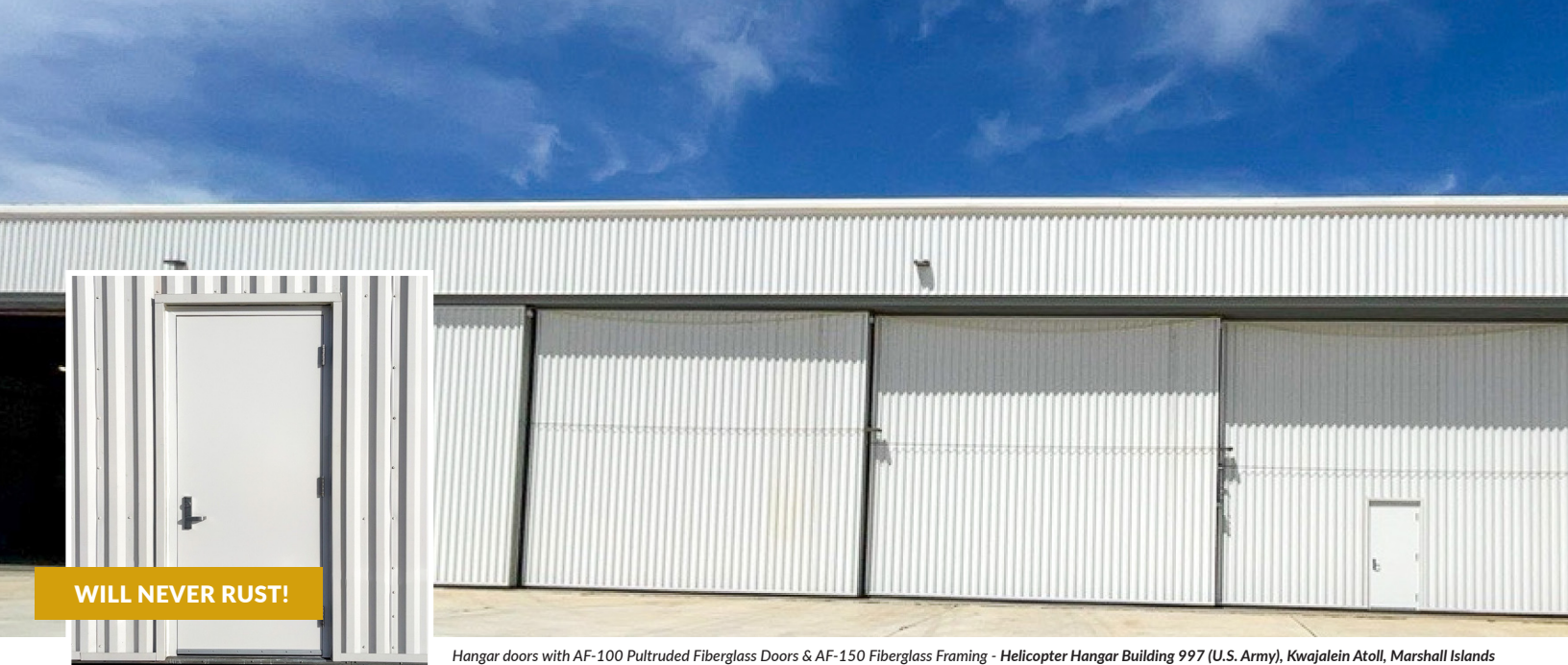
Hangar doors with AF-100 Pultruded Fiberglass Doors & AF-150 Fiberglass Framing - Helicopter Hangar Building 997 (U.S. Army), Kwajalein Atoll, Marshall Islands