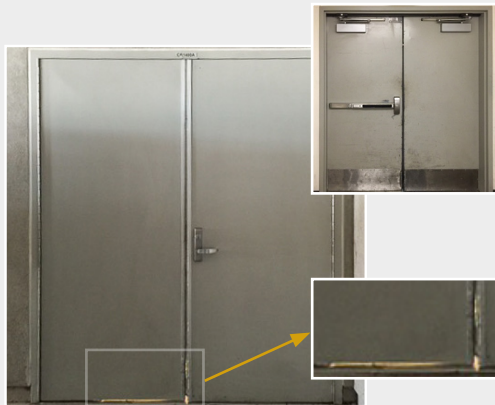
BEFORE: High traffic damages commonly used hollow metal doors, which require frequent maintenance and repainting. Note the problem areas at the bottom and between doors.

Before & After: Sacramento International Airport Terminal Service Entrance