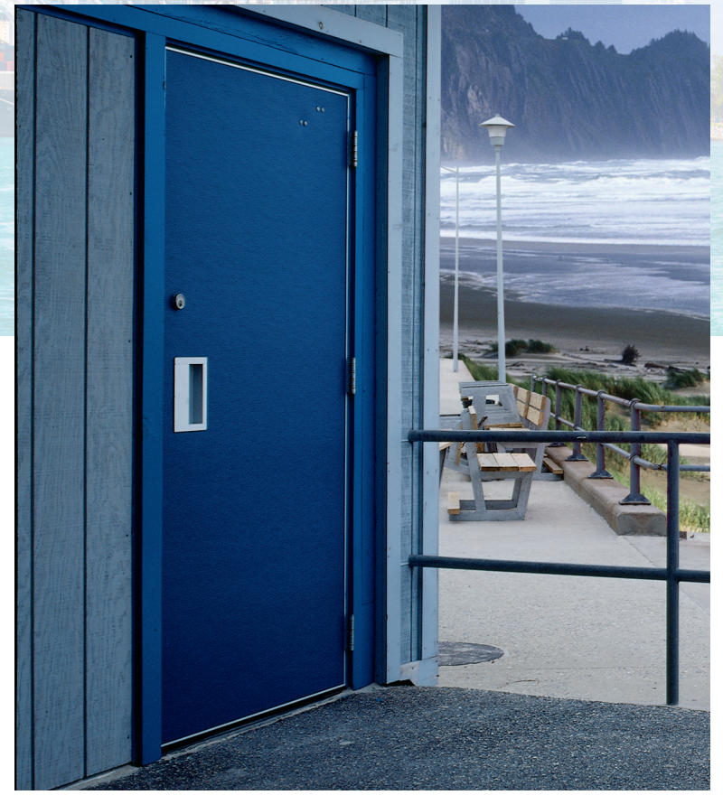
A Special-Lite Door will stay corrosion-free and secure for years to come, even in harsh environments (SL-17 Pebble