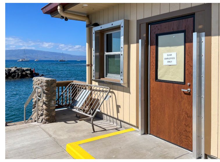
SL-19 Rustic Wood Grain Hybrid FRP Door (painted finish) and Aluminum Framing - Lahaina Harbor Ferry Terminal, Maui, Hawaii