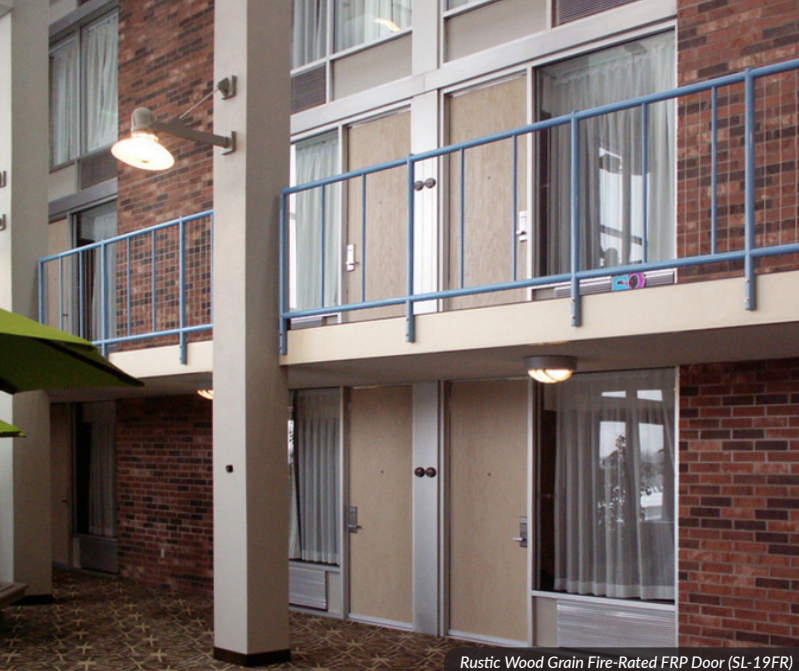
Rustic Wood Grain Fire-Rated FRP Door (SL-19FR)