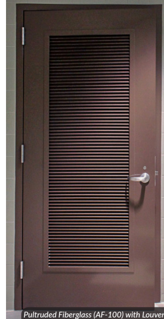
Pultruded Fiberglass (AF-100) with Louvers