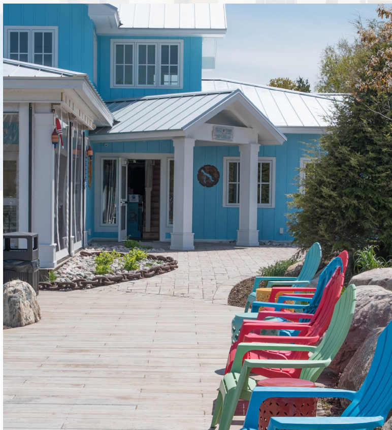
Make a lasting first impression with durable Aluminum Monumental Doors (SL-15).