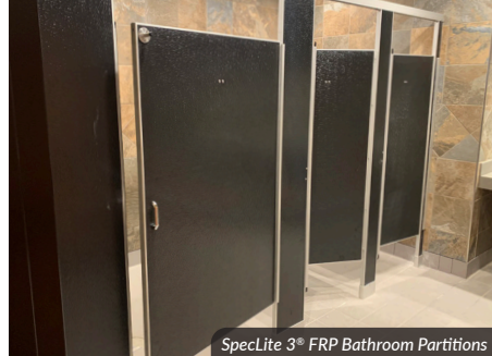
SpecLite 3® FRP Bathroom Partitions