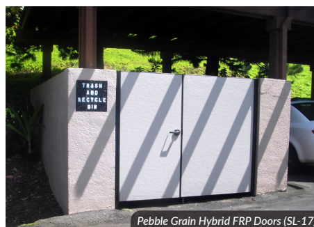
Pebble Grain Hybrid FRP Doors (SL-17)