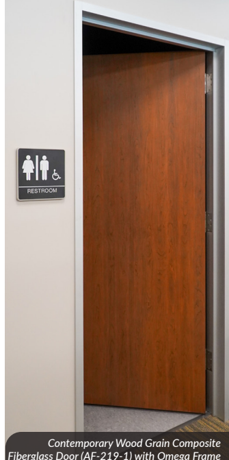
Contemporary Wood Grain Composite Fiberglass Door (AF-219-1) with Omega Frame