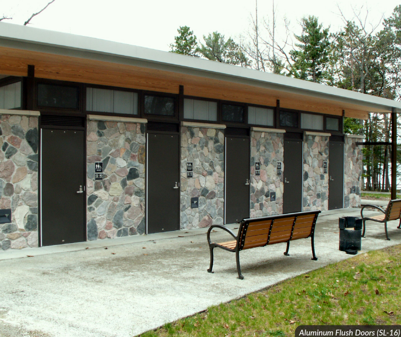
Aluminum Flush Doors (SL-16)