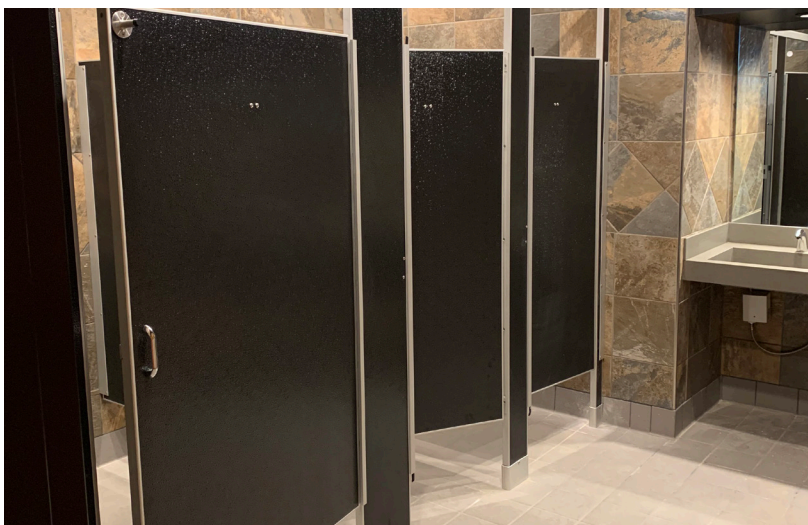
Graffiti-Resistant SpecLite 3® FRP Bathroom Partitions.