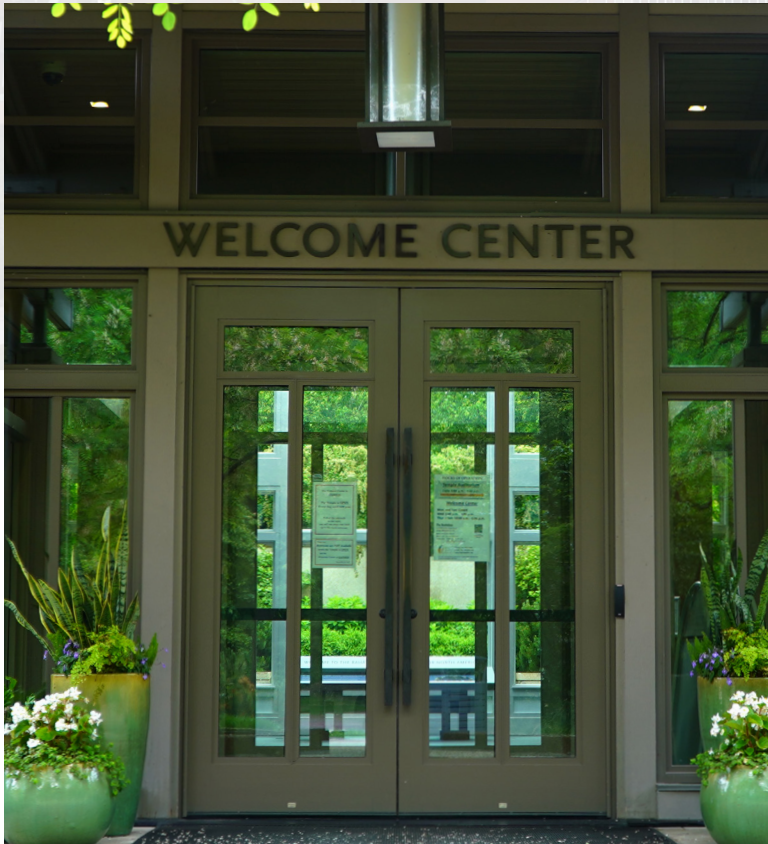
Aluminum Monumental Doors (SL-15) with Painted Finish and True Divided Lites.