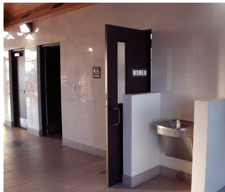
Graffiti-Resistant Pebble Grain Hybrid FRP Doors (SL-17).