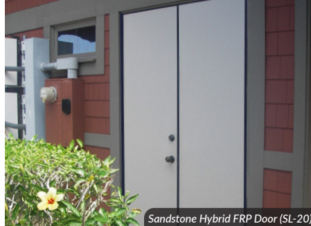
Sandstone Hybrid FRP Door (SL-20)