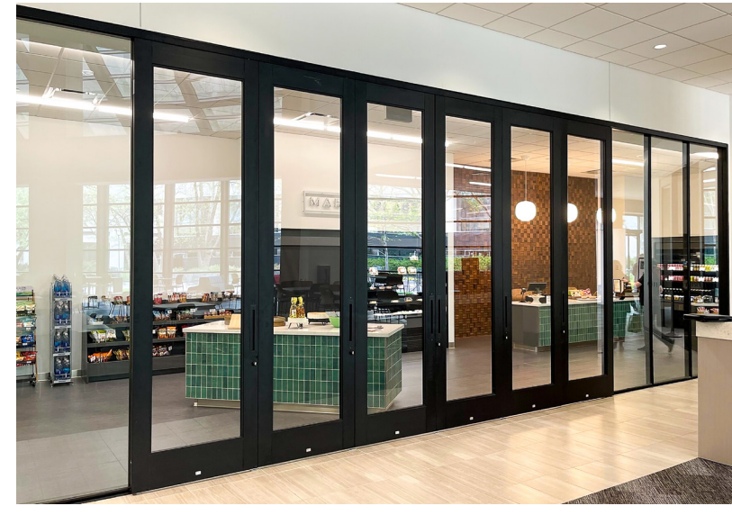
Aluminum\ Monumental\ Doors\ (SL-15)\ with\ Omega\ Sliding\ Door\ System\ and\ Sidelites.