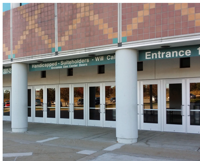
Aluminum Monumental Doors are energy-efficient and durable (SL-15).