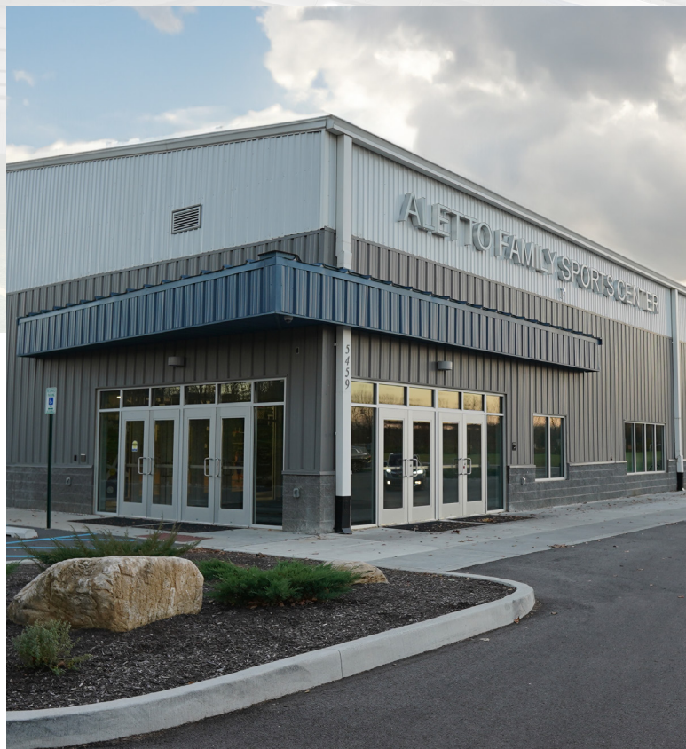
Aluminum Monumental Doors on a high-traffic sports center entrance (SL-15).