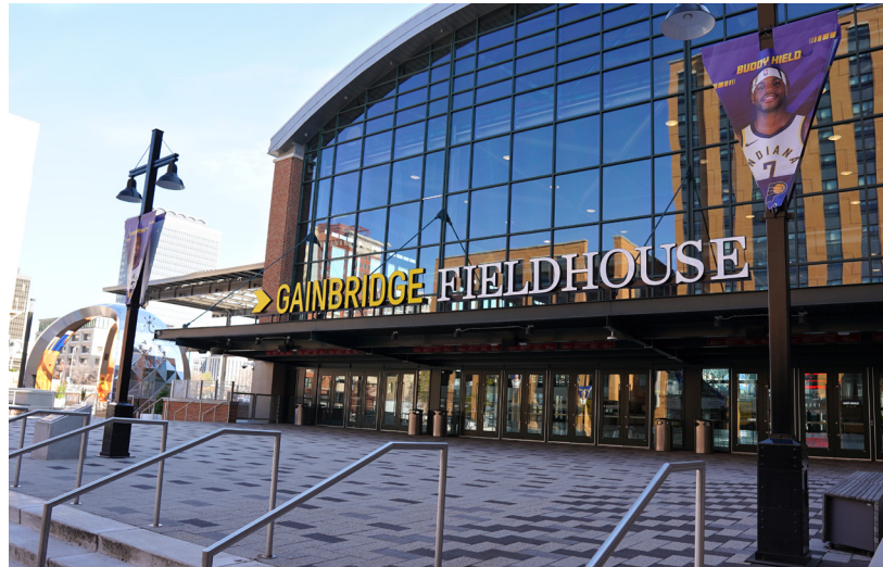
Aluminum Monumental Doors within a Swing-Open Storefront Frame Unit to accommodate oversized equipment.