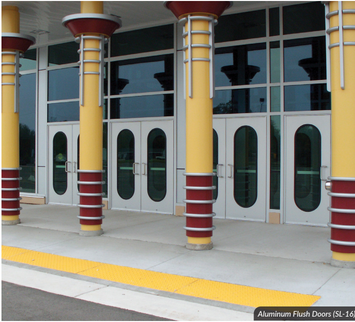
Aluminum Flush Doors (SL-16)