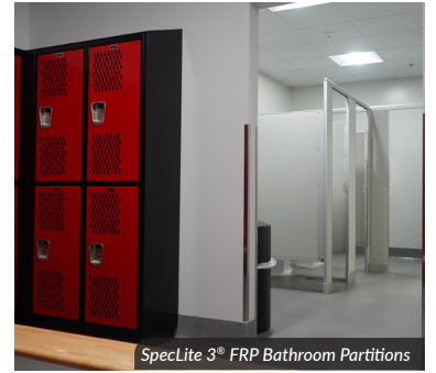
SpecLite 3° FRP Bathroom Partitions