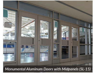
Monumental Aluminum Doors with Midpanels (SL-15)