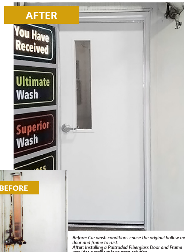
Before: Car wash conditions cause the original hollow metal door and frame to rust. After: Installing a Pultruded Fiberglass Door and Frame provides a resilient long-term solution.

Selecting high-quality doors and frames engineered for corrosion resistance is essential to address the unique challenges of car wash environments. Collaborate with experts who understand the needs of the industry to ensure reliability, security, and durability while meeting aesthetic and maintenance requirements.