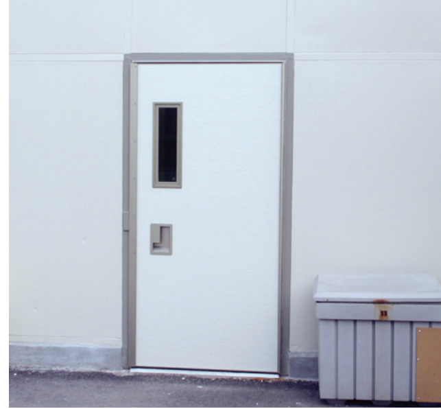
Pebble Grain Hybrid FRP Door (SL-17)