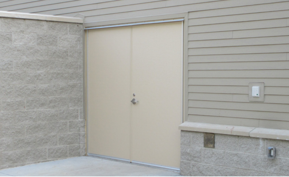
Pebble Grain Hybrid FRP Doors (SL-17)