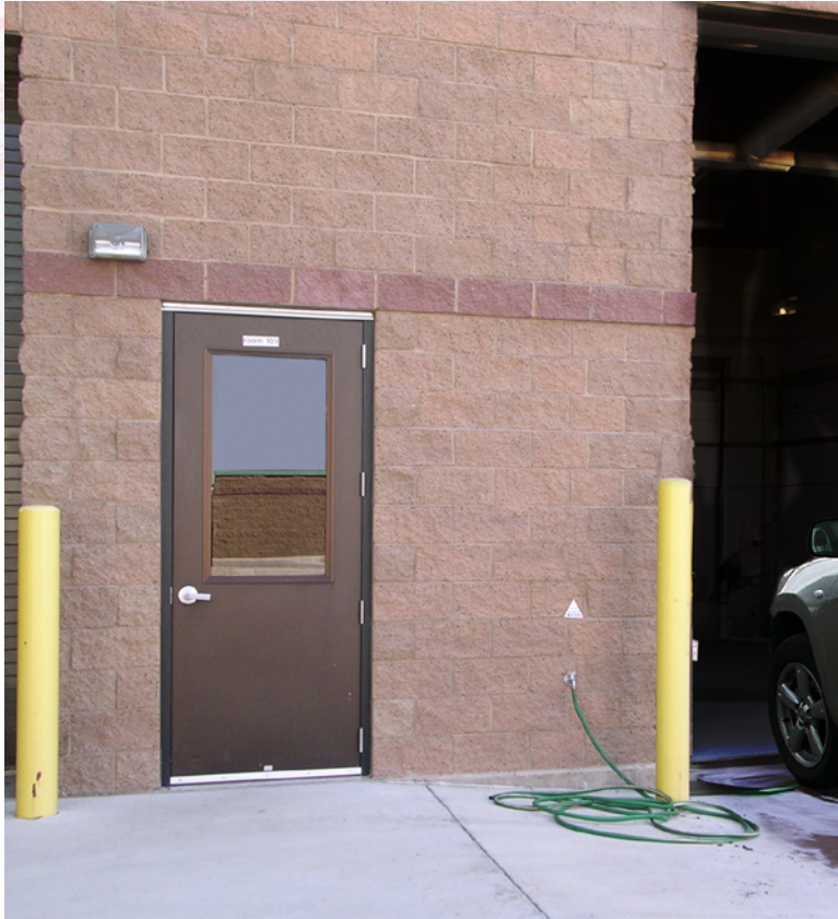
Aluminum Flush Door (SL-16) with vision lite.