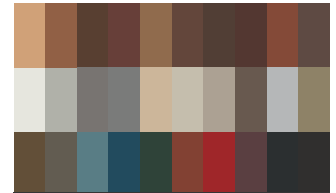
Custom Finish Options