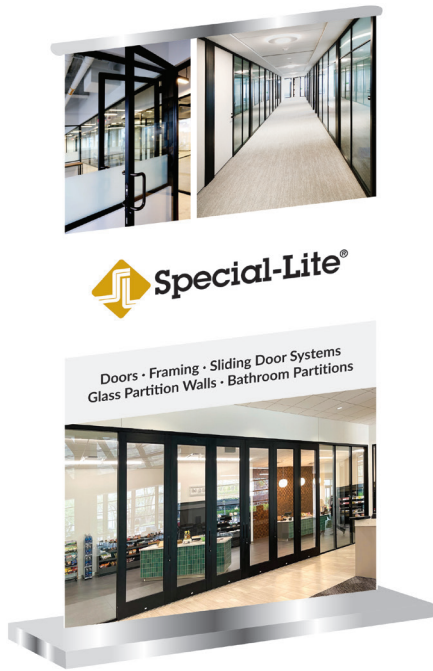
Interior Framing #5212