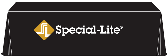
Tablecloth 4' or 8'