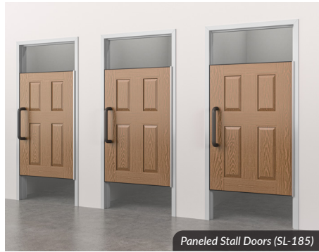
Paneled Stall Doors (SL-185)