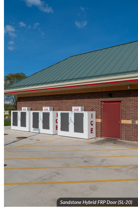
Sandstone Hybrid FRP Door (SL-20)