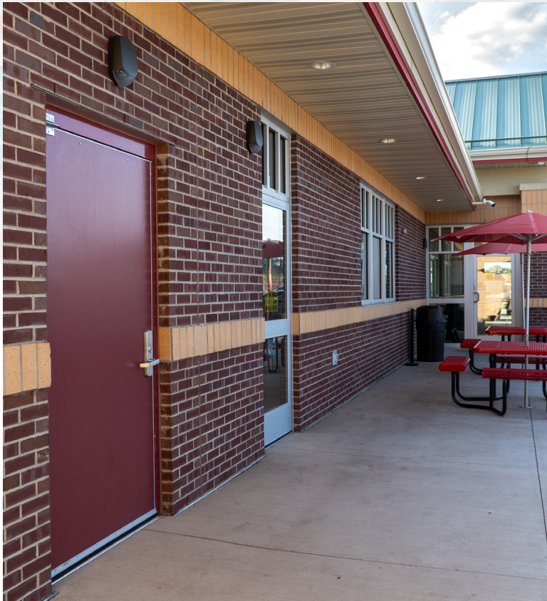
Sandstone Texture Hybrid FRP Door (SL-20) with painted finish.