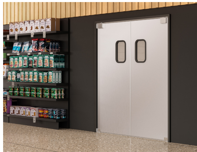
Smooth Aluminum Double-Acting Traffic Doors (DA-16S)