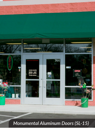
Monumental Aluminum Doors (SL-15)