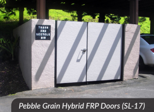
Pebble Grain Hybrid FRP Doors (SL-17)