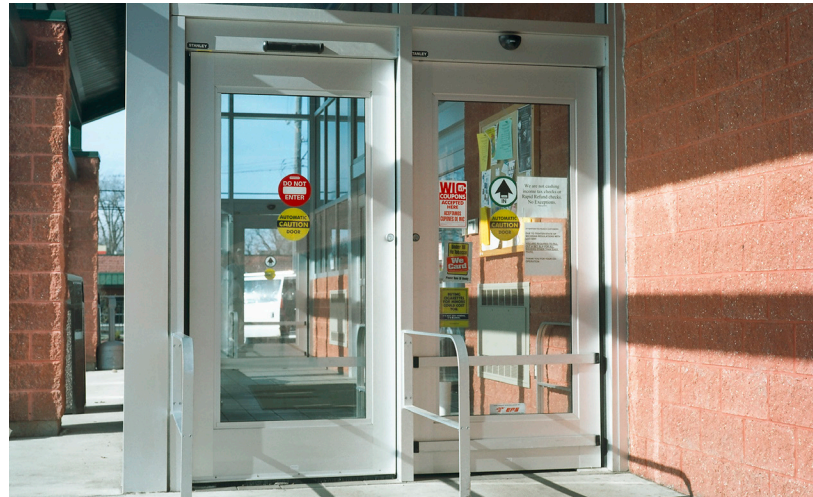
Monumental Aluminum Doors (SL-14)