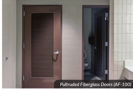
Pultruded Fiberglass Doors (AF-100)