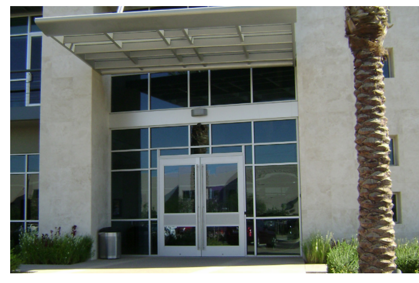
Wide Stile Monumental Aluminum Doors (SL-15)