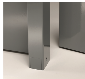
Fixed or Removable Mullion